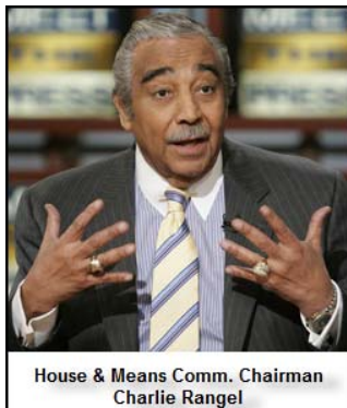
House & Means Comm. Chairman Charlie Rangel

House and Means Committee Chairman Charlie Rangel from New York said that Indian community has added a lot of value in almost every field and he thinks that US and India should be close allies in resolving a lot of global problems.