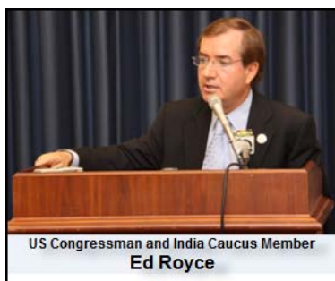
US Congressman and India Caucus Member Ed Royce