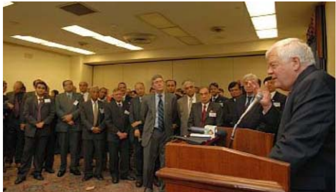
Congressman Jim McDermott addressing members of the task force.