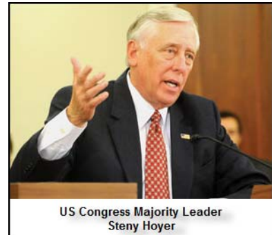
US Congress Majority Leader Steny Hoyer

Majority leader Hoyer said that two largest democracies in the World, US and India have common purpose to achieve the global peace while tackling the terrorism in the world. He also mentioned that Dr. Manmohan Singh's recent visit to the US for a State Dinner was the start of new era for US-India relations. He assured NFIA community that he will do whatever he can to make US-India relations stronger.